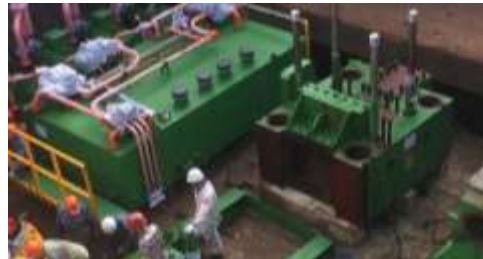
Coal, Iron Ore, Grain