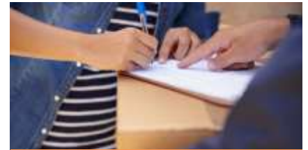
Customer Receives Goods