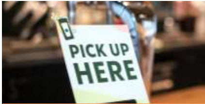
MBM Arranges Pickup/Trucking