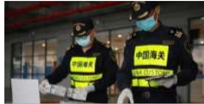
Export Customs Clearance