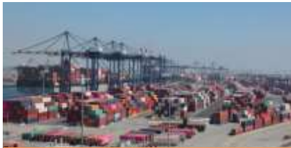
Customs Clearance and Tax Payment