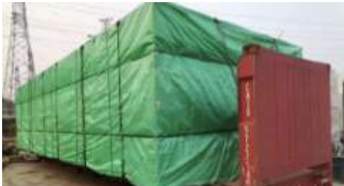
Flat Rack/Flatbed /OT Container