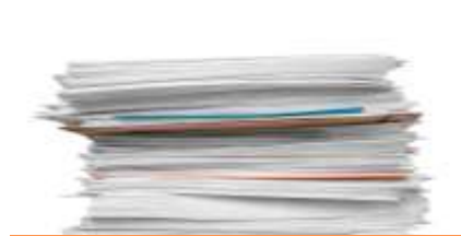
Get Delivery Order