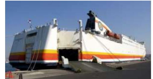
Vehicles, Equipment, Oversized Cargo