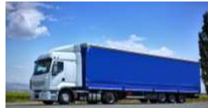
Destination Agent delivery