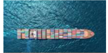
Sea/Air Freight to Port/Airport