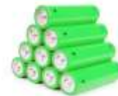
Special Cargo DDP Solutions

MBM has established door-to-door dual clearance services in the United States, Canada, the United Kingdom, Europe, South America, and the Middle East regions.